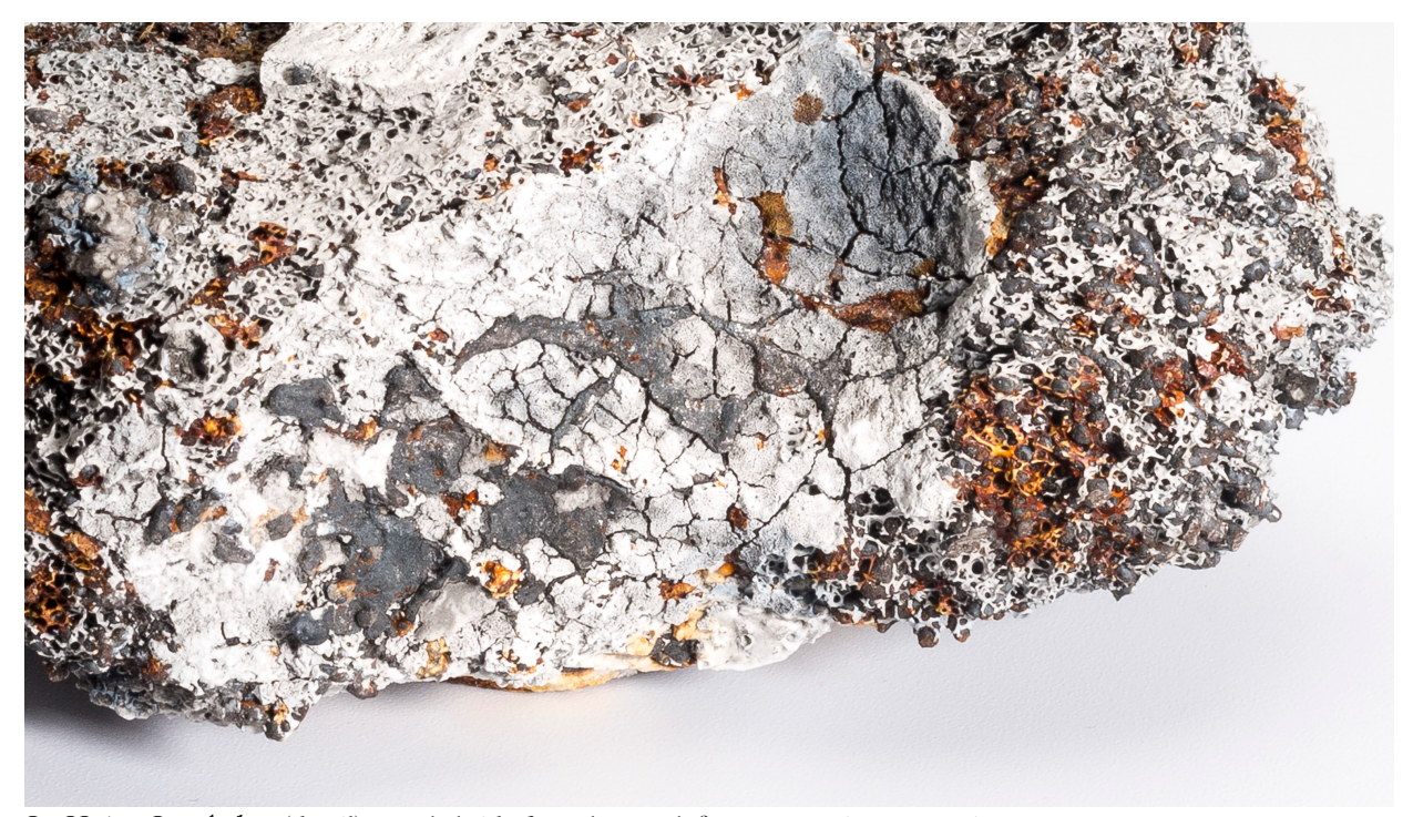
Ly Hoàng Ly, Ashes (detail) 2013, hybrid of cow bone ash & remnants, iron, ceramic

The Factory Contemporary Arts Centre is delighted to present Ly Hoàng Ly's first solo exhibition and most comprehensive presentation of her work to date, as part of her on-going project '0395A.DC'. This multimedia, collaged body of work will showcase the artist's ongoing inquiry into the epic story and continuous struggle of human (im)migration, whilst highlighting the contested nature of the memorisation, documentation and circulation of history.